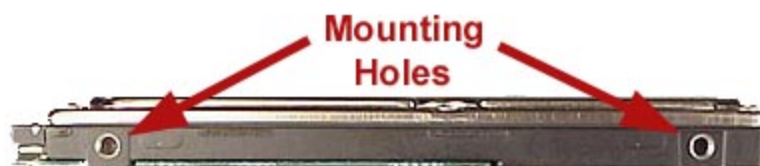
Figure 2.HDD Mounting Holes

Important Note: Disconnect power from your computer system before beginning installation.